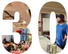
Men Received Residential Services