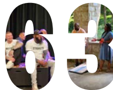
Career Development Sessions

100% of residential participants completed Striving Towards Active Recovery curriculum